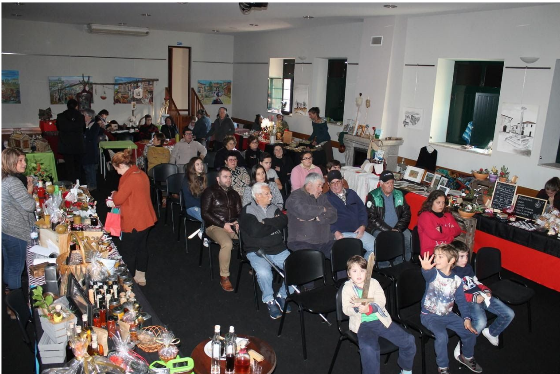
2 ZxMKn XZ 3MjIXZ @Nbn1 M MjVKn'<nfn'

Ýä' / | | an" 5_bib MKZ" nx| ny@jMZY" Z| xny;k MZxbMy@ÜS_nxk NxnxFÜÄ